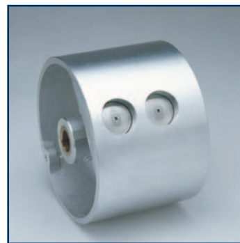
Moulding disk for meatballs Ø 40